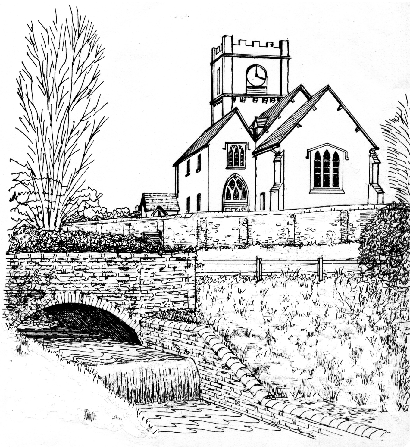
Old St. Mary's church